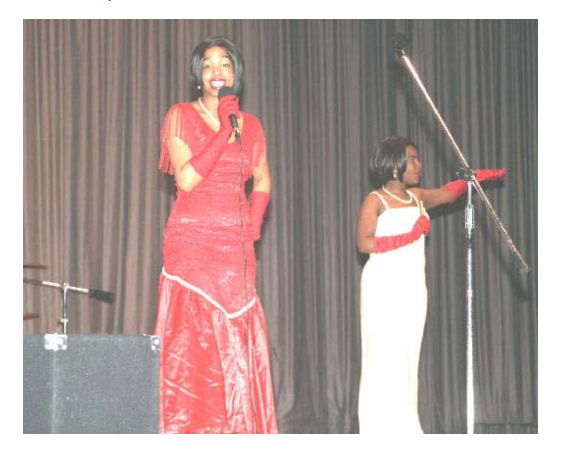
Students perform as Diana Ross and the Supremes