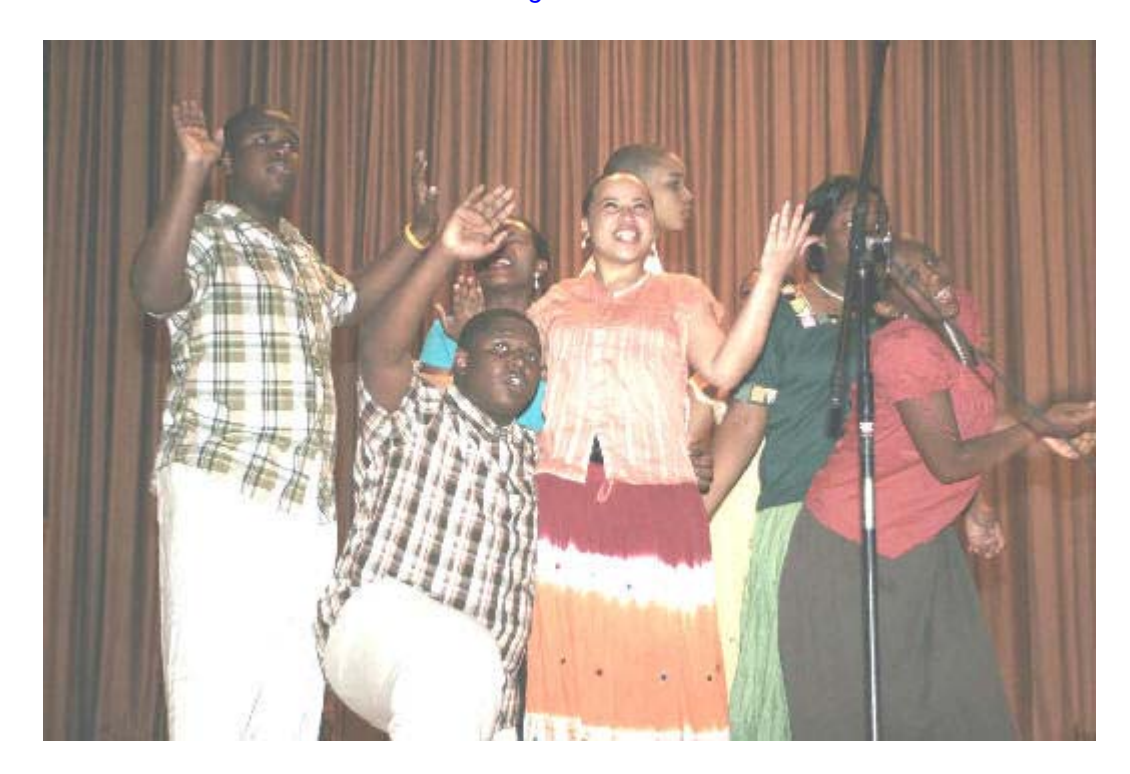
Duke Ellington Show Choir's classical soul revue