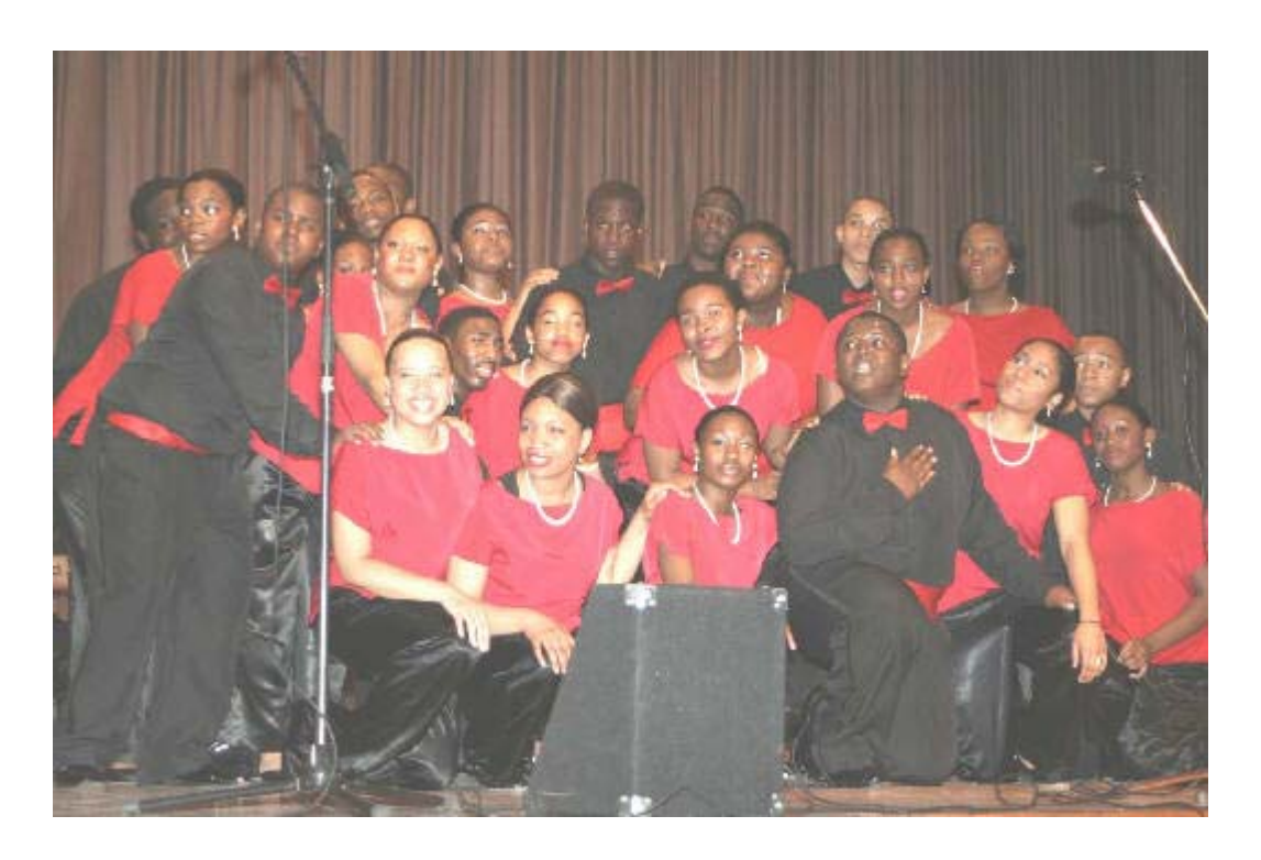
Duke Ellington Show Choir